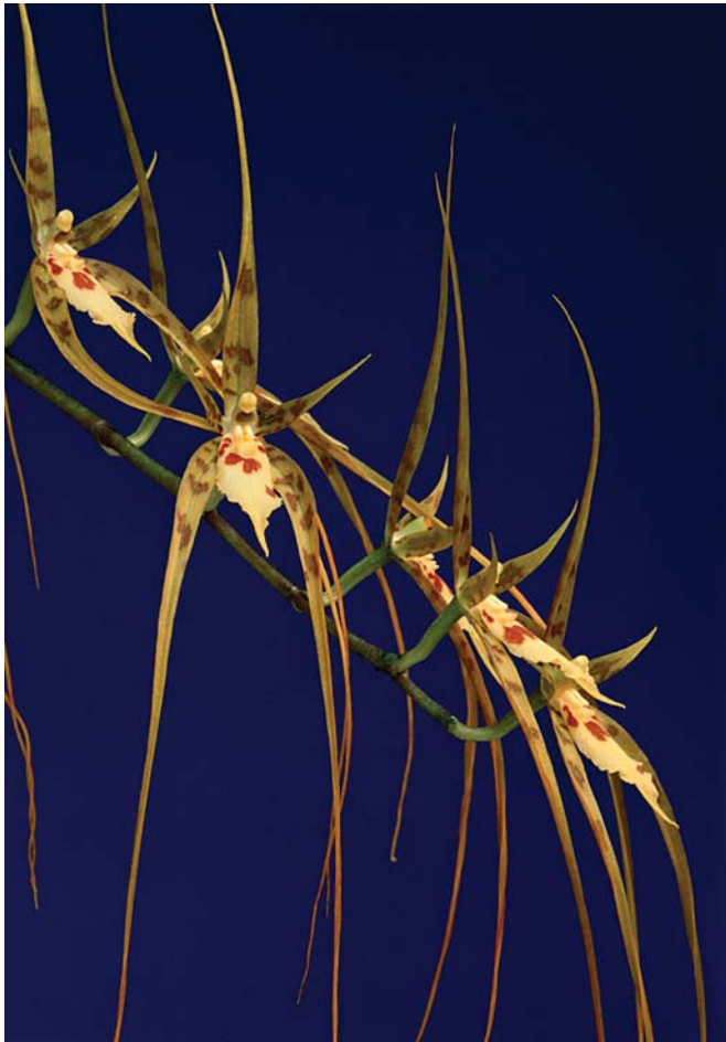
Fig. 3. Brassia caudata is a species from the lowlands that requires warm conditions and high humidity year round.