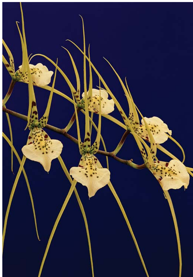
Fig. 6. Some authors suggest that the correct name for the “warty-lipped” Brassia verrucosa from Costa Rica should be Brassia brachiata ; others consider it just a subspecies of Brassia gireoudiana .

arcuigera in one population in Panama vary from about 10 cm (4 inches)—45 cm (18 inches) (N.H. Williams, pers. comm.). Brassia arcuigera is the only Brassia in Costa Rica with monophyllous (single-leaved) pseudobulbs, and the largest flowered species. It grows in premontane rainforest (mid-elevation rainforest with a rather warm climate), usually above 800 m (2,600 feet).