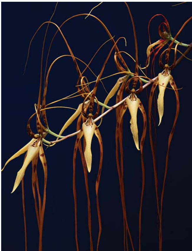
Fig. 1. In some clones of Brassia arcuigera , individual flowers may be longer than 50 cm (20 inches).

Norris H. Williams segregated Brassia section Glumaceae , which includes the species with enlarged floral bracts and mostly reduced pseudobulbs, into the genus Ada (Williams, 1972). Species of the genus Brassia in the strictest sense can be easily recognized by the rather large plants with conspicuous, one- to two-leaved pseudobulbs, lateral inflorescences with small floral bracts, spider-shaped flowers with spreading, elongate sepals and the lip free from the column and a pollinarium provided with a narrow stipe.