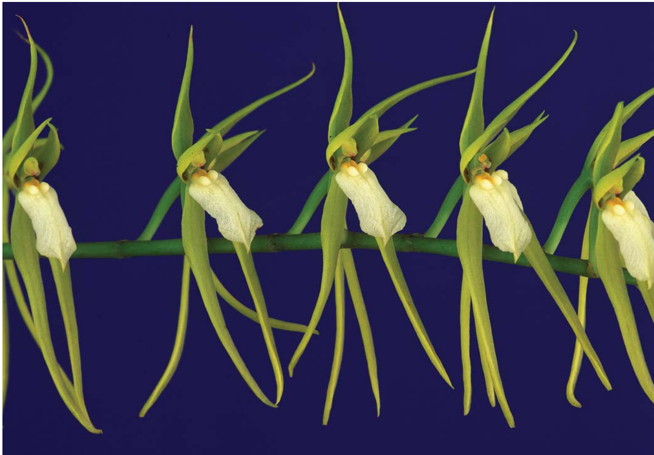
Fig. 8. The flowers of Brassia suavissima are small — less than 6 cm ( 2\frac{3}{8} inches) long — and strongly scented.

Brassia suavissima differs from the Central American B. signata by the dense, many-flowered (18 to 30 flowers) inflorescence (lax, four- to 10-flowered, in B. signata ), the presence of two conspicuous teeth in front of the linear keels at the base of the lip (absent in B. signata ), and the unspotted floral segments (spotted with reddish-brown in B. signata ). The new species is also somewhat reminiscent of the South American B. lanceana , from which it mainly differs by the calli at the apex of the basal keels of the lip, which are prominent, erect and rounded in B. suavissima , and inconspicuous in B. lanceana .