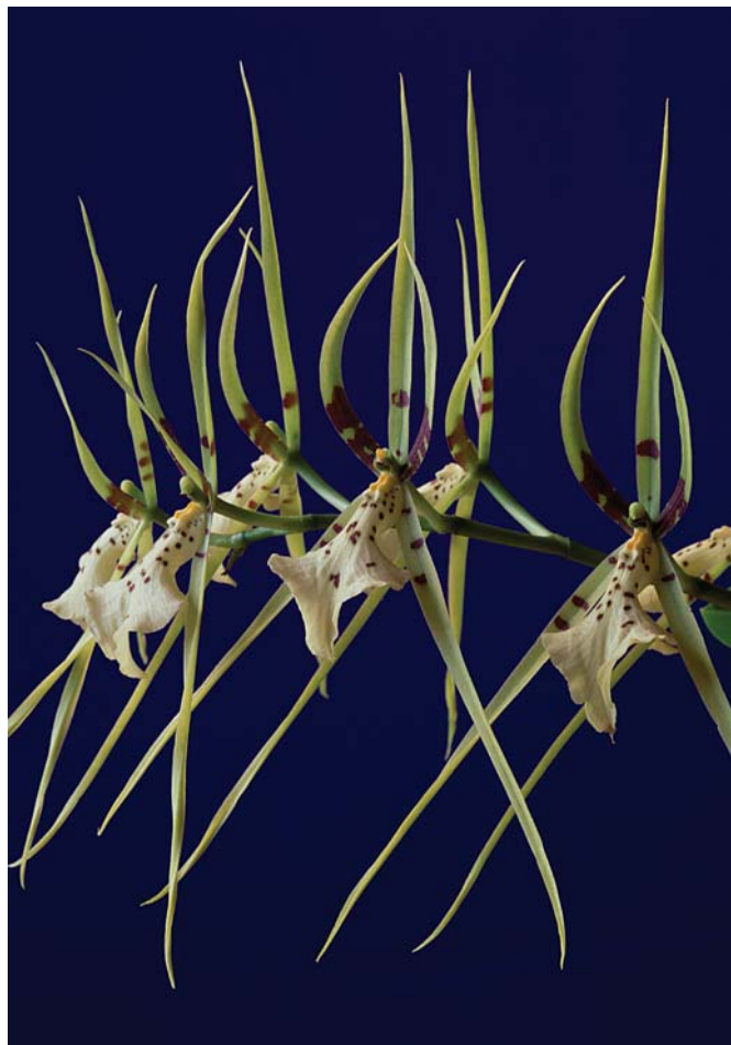
Fig. 5. Probably the showiest of Costa Rican species, Brassia gireoudiana grows on the Pacific slopes of the Continental Divide in Costa Rica, where rainy and dry seasons are well defined.