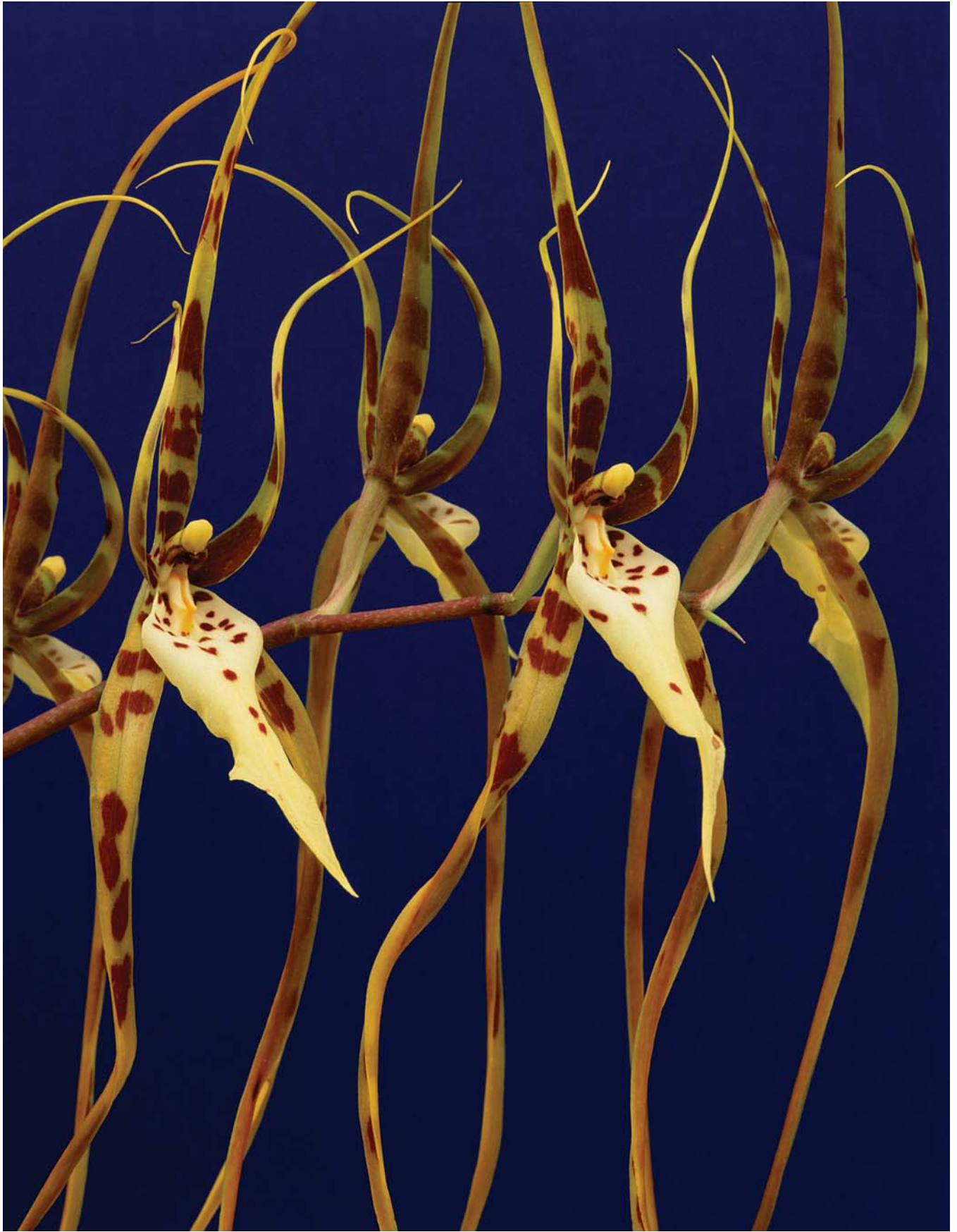
Fig. 2. Brassia arcuigera is one of the most common species in Costa Rica, where it occurs at elevations ranging from 500–1,500 m (1,640–4,920 feet).